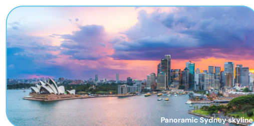
Panoramic Sydney skyline

Your journey comes to an end after your breakfast this morning. Free until check out time from your hotel. You will be transferred to Sydney International Airport for your International flight bound home taking with you the unforgettable and lasting memories of a wonderful Australia.