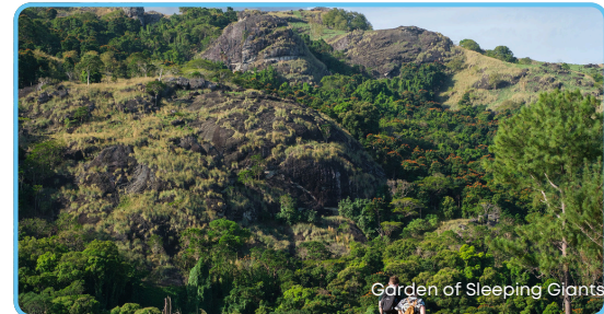
Garden of Sleeping Giants