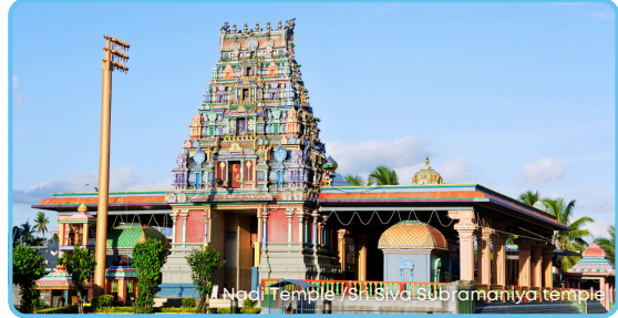
Nadi Temple/ Shri Sri Subramaniya temple