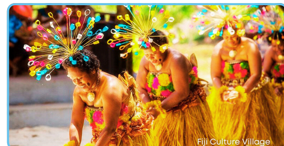
Fiji Culture Village