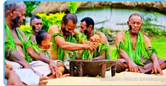
sevusevu (Kava ceremony)