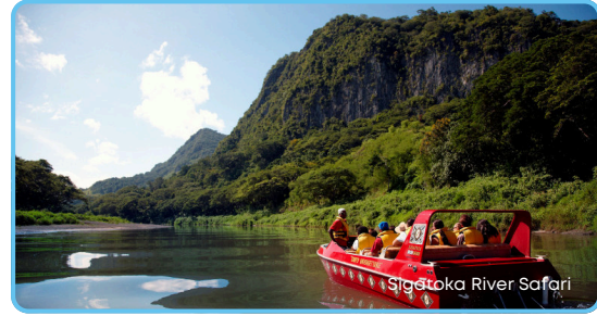
Sigatoka River Safari

In Nadi – Crowne Plaza Nadi Bay Resort & Spa or similar