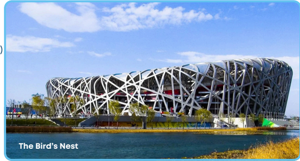
The Bird's Nest