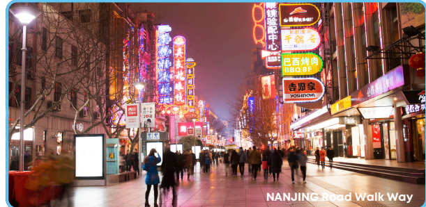
NANJING Road Walk Way

Hotel: 5* Palace Hotel in Beijing or Similar