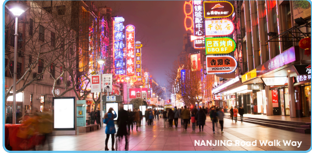
NANJING Road Walk Way

Hotel: 5* Palace Hotel in Beijing or Similar