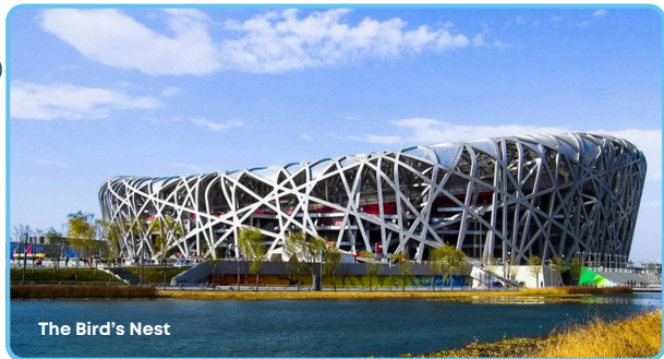
The Bird's Nest

Hotel: 5* Palace Hotel in Beijing or Similar